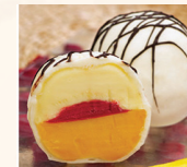
Mango Passion Fruit Bomba

Mango Panna Cotta $8 Sweetened Cooked Cream Topped with a Refreshing Mango Sauce