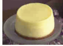
New York Cheesecake