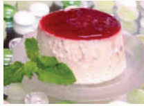
Raspberry Panna Cotta