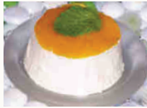
Mango Panna Cotta