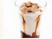
Coppa Strawberries & Caramel