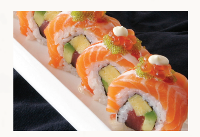
Emperor's New Roll