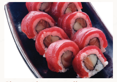
Cherry Blossom Roll