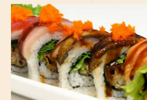
Spider Rainbow Roll $8.45