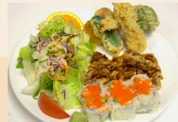
CA Roll, Tempura & Chicken Teriyaki