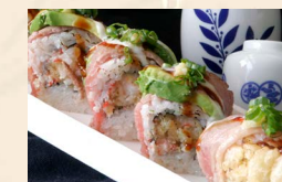
Golden Ox $11.95