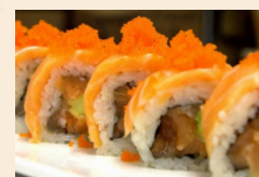
Double Sake $11.95