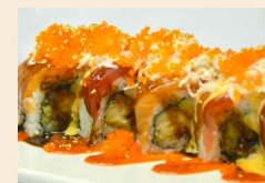
Titanic Roll $12.95