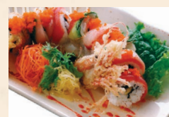
Dragon Roll $13.95