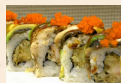
Dancing Lion Roll $10.95