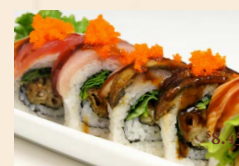
Spider Rainbow Roll $8.45