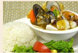
Seafood Curry $11.95

All Dinners Include: Soup, Steamed Rice (Brown Rice optional. $1 extra) and Ice Cream