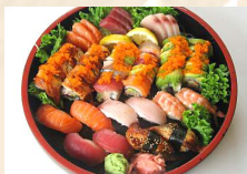
Sushi & Sashimi Tray