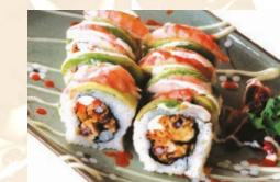
Fire & Ice $10.95