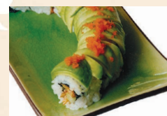
Caterpillar Roll $8.75