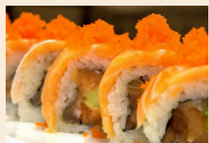
Double Sake Roll $11.95

All pictures are for reference only 🐟 - Contains Raw Fish