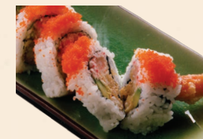
Crunchy Roll $8.75