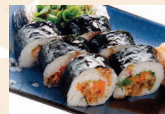
Spider Roll $8.45