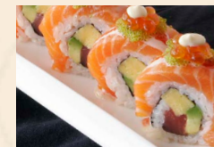
Emperor's New Roll $11.95