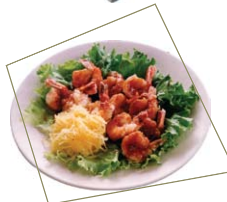
PAN FRIED PRAWNS