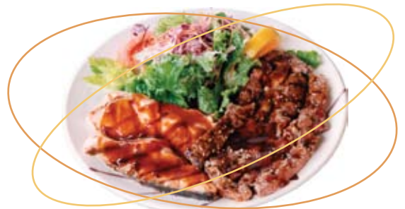
BEEF & SALMON TERIYAKI