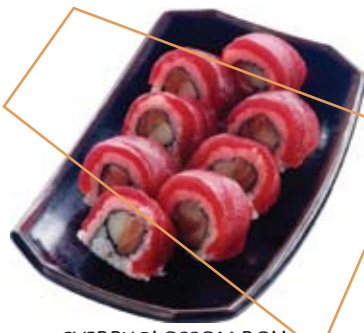
CHERRY BLOSSOM ROLL